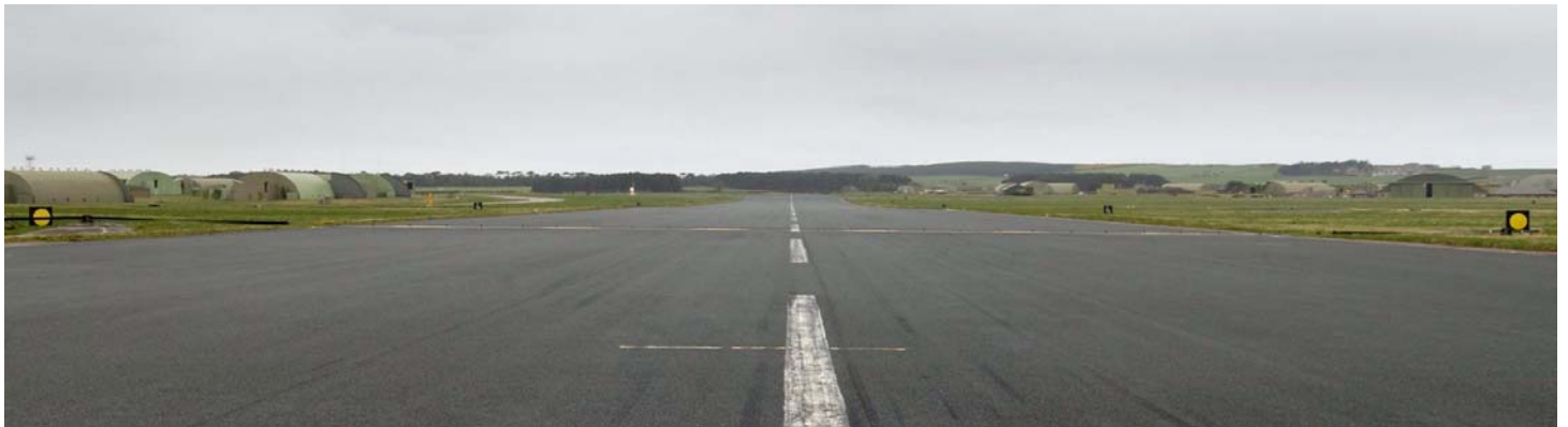
RHAG from threshold

c. Air Traffic Control will pass the state of the cables. Land beyond a rigged approach cable, and aim to turn off before an overrun cable. Similarly, aim to start the take-off run beyond an approach cable and lift off before an overrun cable. This will reduce the available runway length, so adjust your performance calculations to suit. In an emergency, the aerodrome may be able to de-rig a cable for you to make a safe landing, but that may take up to 20 minutes.